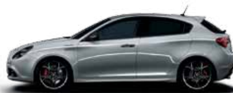
620 Silverstone Grey Option