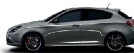
318 Stromboli Grey Option