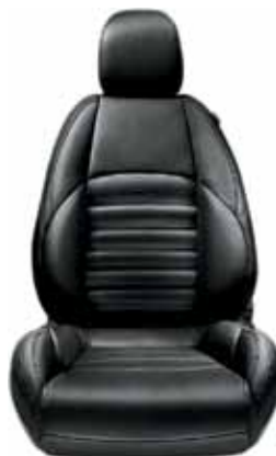
408 - Black Leather (Option on TCT Only)