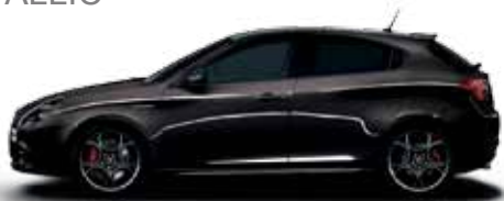
805 Etna Black Option