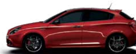
414 Alfa Red Option