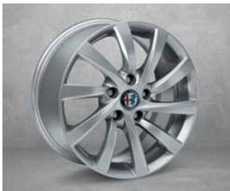
431 - 16-Inch Turbine Alloy Wheel (Standard on Super MT)