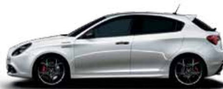
764 Perla Moonlight Option