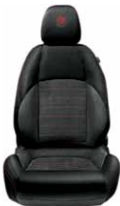
308 - Fabric & Alcantara Black & Light Grey (Linked to Veloce Pack - NAW: 764, 409)