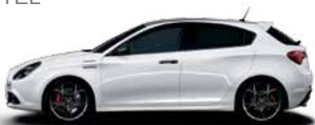
217 Alfa White Standard