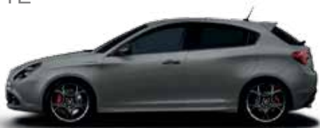
529 Magnesio Grey Option

*Overseas model shown in imagery, Australian model and actual colours may vary. All product illustrations and specifications are based upon current information. FCA Australia Pty Ltd ABN 23 125 956 505 trading as FCA Australia reserves the right to make changes from time to time, without notice or obligation, in prices, specifications, technical information, accessories, colours, materials and to change or discontinue models. All vehicles, models, features, colours and/or accessories shown may not be available in Australia from time to time or at all. "Optional" may mean available as an option but only at an additional cost. For the details of the vehicles, models, features, colours and/or accessories currently available in Australia, please contact an authorised Alfa Romeo Dealer.