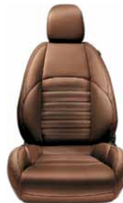
465 - Brown Leather (Option on TCT Only)