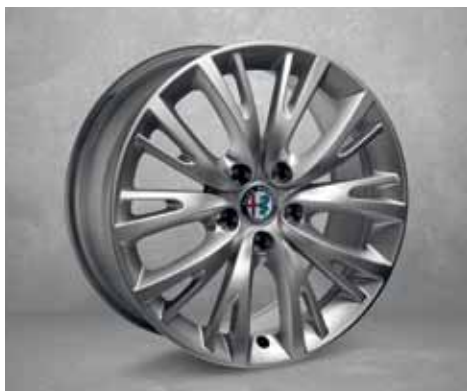
74B - 17-Inch 10 Twin-Spoke Alloy Wheel (Standard on Super TCT)