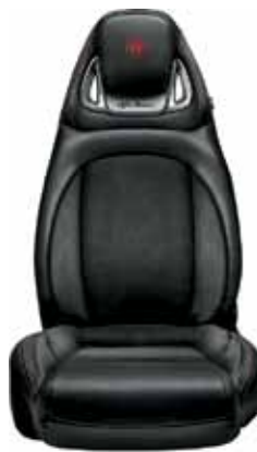
323 - Leather & Alcantara Black (Standard on Veloce)