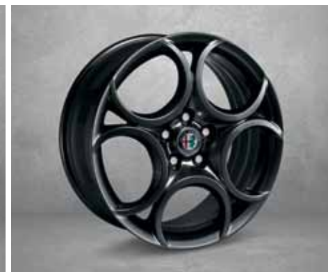
5FB - 18-Inch Black 5-Hole Alloy Wheel (Option on Veloce / Linked to Veloce Pack)

*Overseas model shown in imagery, Australian model and actual colours may vary. All product illustrations and specifications are based upon current information. FCA Australia Pty Ltd ABN 23 125 956 505 trading as FCA Australia reserves the right to make changes from time to time, without notice or obligation, in prices, specifications, technical information, accessories, colours, materials and to change or discontinue models. All vehicles, models, features, colours and/or accessories shown may not be available in Australia from time to time or at all. "Optional" may mean available as an option but only at an additional cost. For the details of the vehicles, models, features, colours and/or accessories currently available in Australia, please contact an authorised Alfa Romeo Dealer.