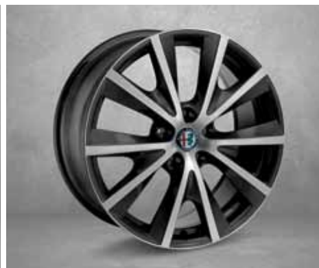
7HP - 18-Inch 5 Twin-Spoke Chrome/Burnished Alloy Wheel (Standard on Veloce)