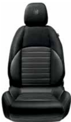
123 - Fabric Black & Dark Grey (Standard on Super)