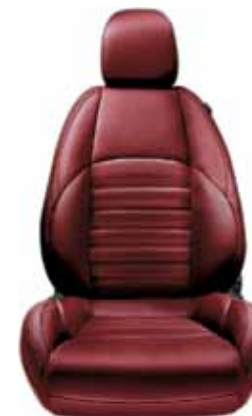
401 - Red Leather (Option on TCT Only)