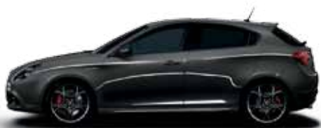
409 Lipari Grey Option