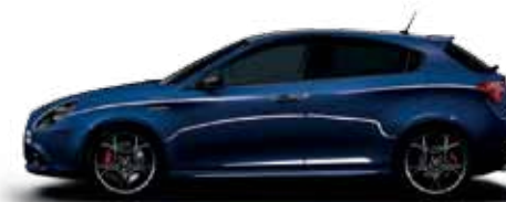
486 Anodizzato Blue Option