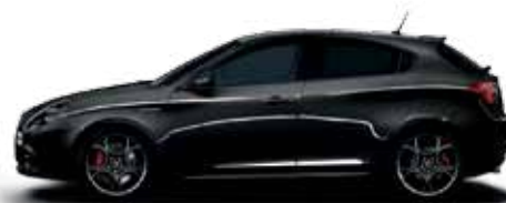
601 Alfa Black Option